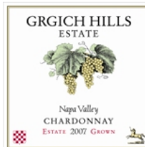
Grgich Hills Chardonnay

Glad you asked. In my experience, I have found Huge Bear Chardonnay , out of Sonoma ($40) to be a consistent show for Chardonnay in all of its oaked, malolactic glory.